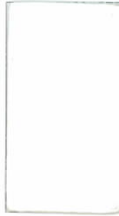
Alum Tawed Calf Cream & White Also available with an embossed grain