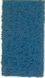
Pentland Goat 22 shades