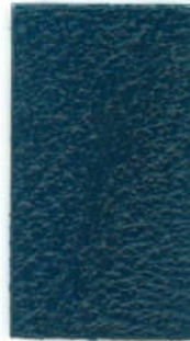
Embossed Skiver 15 shades assorted grains available