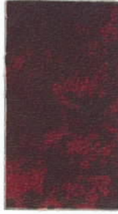
Antique Calf Please enquire about availability of other shades and effects.